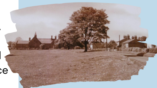
Townend Field looking towards Great Ouseburn c. 1950.